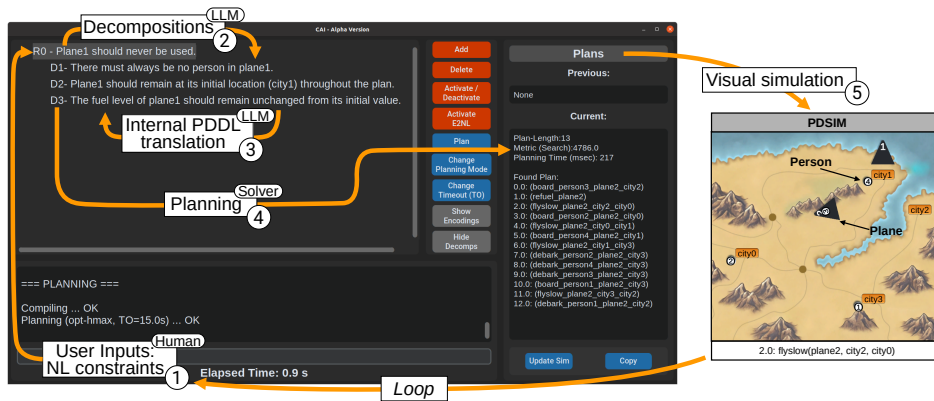
Figure 2: Main interface and nominal workflow

planning systems. A key design principle of our pipeline is that users never directly interact with PDDL representations, maintaining the accessibility that motivated our approach.